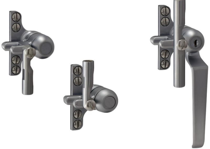
B646NOSEOI & 2 Connectors

B195K09FTROI - Key Locking with Connector